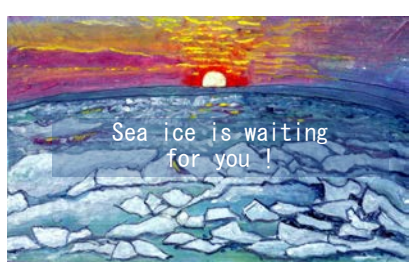
Sea ice at Mombetsu by Takao Nakajir

The instructions are on the Symposium website.