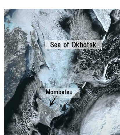
Satellite image of Sea of Okhotsk