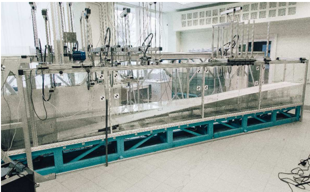
Fig. 2. Hydrodynamic wave tank

A similar method was used in (Kurkin and others, 2019) to expand the area captured by cameras. The creation of the PIV system at the LMNAD laboratory (Nizhny Novgorod State Technical University na RE Alekseev, Nizhny Novgorod) will allow obtaining more information about the course of experiments by collecting data on the distribution of velocities within the fluid flow during experiments with internal waves as a non-contact method for measuring the flow rate and the rate of particle transfer by the flow both on its surface and in the depth of the liquid. To develop this system, the laboratory was modernized - special dimmers were installed on each light source, the video capture system was installed on a special guide and in order not to create glare during shooting, a special spandex curtain was used. These are minor but necessary measures to ensure the best possible image quality and to minimize the glare when reflected from the acrylic walls of the wave reservoir itself (Fig. 2).