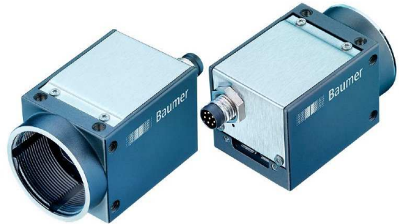
Fig. 3. Camera Baumer VCXU-23M

The PIV system in its simplest version consists of a laser emitter-camera pair. This version of the system uses high-speed cameras Baumer VCXU-23M (Fig. 3) with a set of wide-angle lenses, a pulsed laser and a system of cylindrical lenses to form a plane of laser radiation also called a "laser knife".